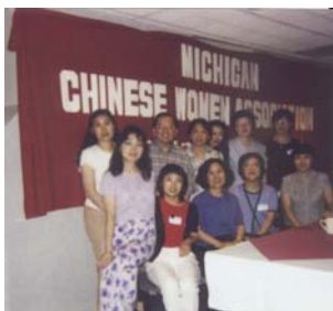
LHAs collaborate with Michigan Chinese Women Association