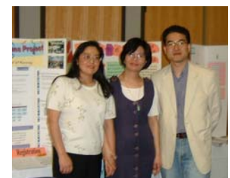
LHAs at a health affair