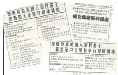
LHAs' programs are publicized through various media channels.