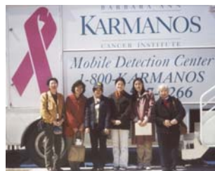
LHAs provide Asian women transportation and interpretation in getting cancer screening.