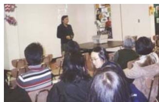
An LHA is introducing the BCCCCP.