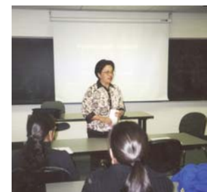
An LHA is presenting HAAP and its programs.