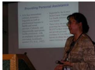
HAAP director is presenting at the BCCCP annual meeting

The invited keynote speaker and other speakers addressed issues related to general health, breast and cervical cancers, and the early detection of these diseases.