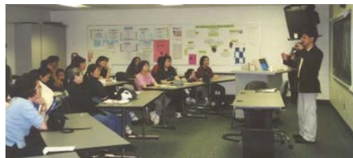
A Gynecologist is invited to present on breast and cervical cancer and the early detection.

Among the 82 trained LHAs, about 90% are working actively in the community to promote breast and cervical cancer screenings. Collaborating with community organizations (i.e., Women Association, Chinese schools, churches, etc.), LHAs