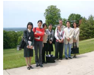
State BCCCP officers with HAAP team