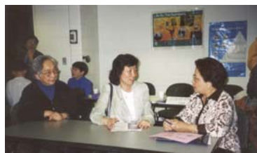
An LHA is recruiting eligible women into BCCCCP.