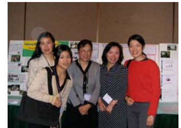
HAAP team in front of HAAP posters